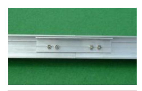
Butt joints (above) are made by the Straight Connector which keys into the main I-Beam, beams are pre-drilled for easy assembly