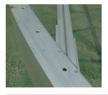
I-Beam to Rim bolted connection is strong and provides a clean surface for the sheeting and its clamping