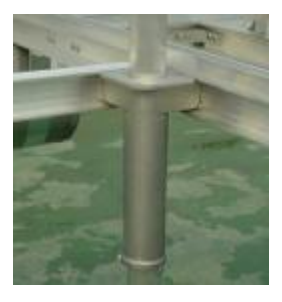
Landing leg sleeves are keyed into the I-Beam frame