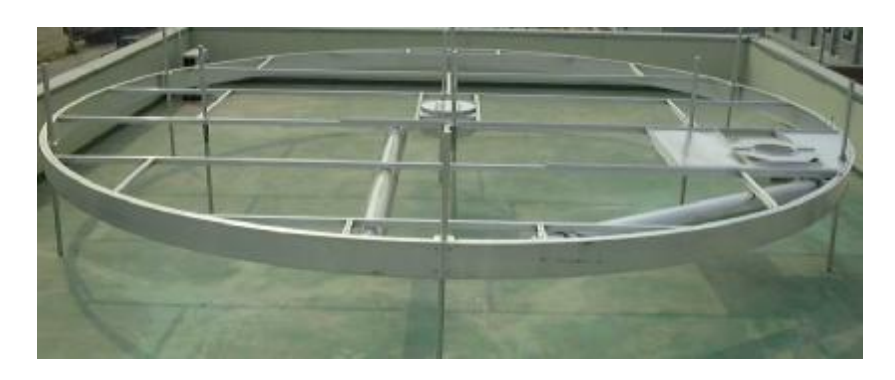
Test IFR at our factory. Note that the pontoons are not connected to the landing legs. The potential for pontoon end cracking is eliminated

The BTE Heavy Duty IFR is ideally suited to service in earthquake prone regions or in those tanks subject to sloshing and/or turbulence due to high fill rates or mixers.