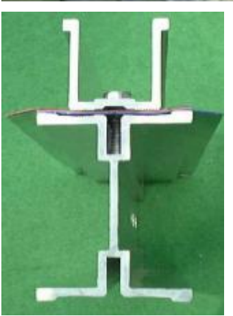
The BTE I-Beam (approx. full size) and sheeting clamp channel (left) represents a higher section modulus and is much stronger than other IFR main beams. This makes for a more durable product.